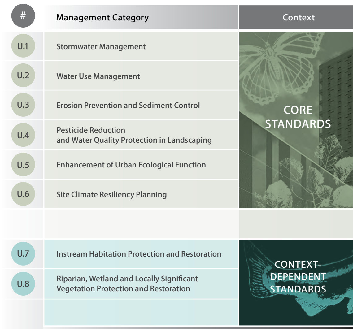
Table 1. Salmon-Safe’s Eight Management Categories

The Certification Standards describe the performance requirements or desired outcomes for the following eight Salmon-Safe management categories: