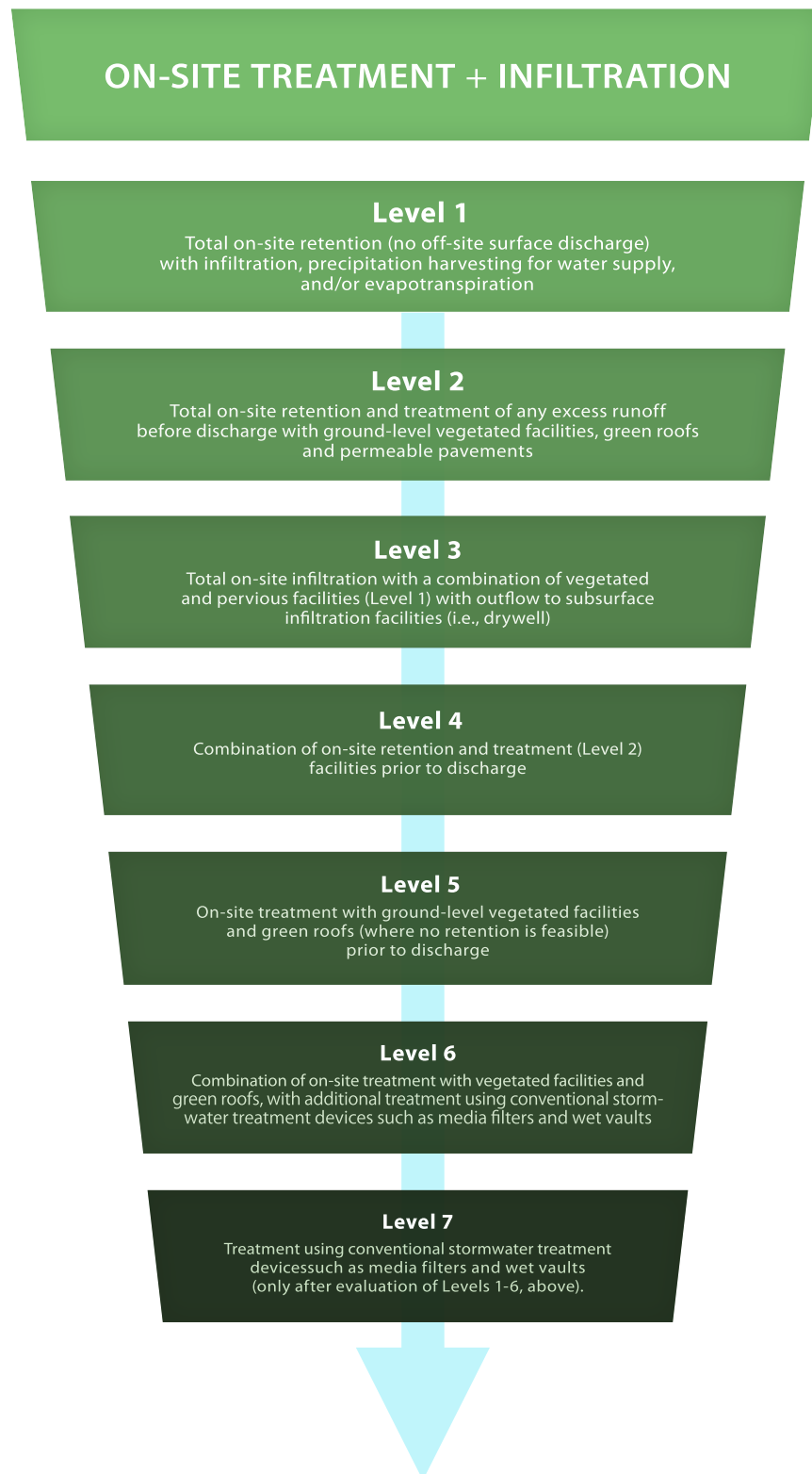
Figure 1. Salmon-Safe Urban Standard U.1.7: Stormwater Management Planning Hierarchy

Stormwater management planning generally follows a hierarchy that prioritizes total on-site treatment and infiltration as follows: